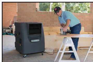
PORTACOOOL CYCLONE 130