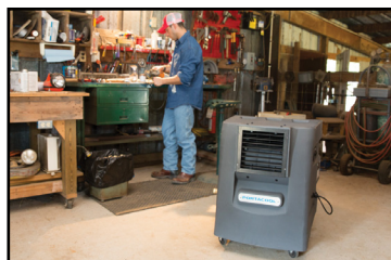
PORTACOOOL CYCLONE 120