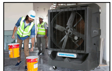
PORTACOOOL CYCLONE 160